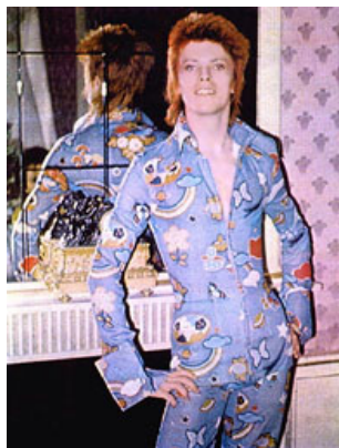
Your Basic Liberal

Other men who were weaker and less skilled at hunting learned to live off of the conservatives by showing up for the nightly BBQ's and doing the sewing, fetching, clean-up, and hair dressing. Some of these liberal men eventually evolved into women. The rest became known as girliemen. This was the beginning of the Liberal movement.