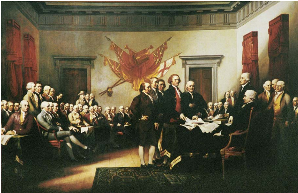
Declaration of Independence , John Trumbull (oil on canvas, 12' x 18') Commissioned 1817; purchased 1819; placed 1826 in the Rotunda

We are looking for volunteers to write 500 word editorial comments on local governmental activities. Writers can use a pen name if they do not want their real names disclosed. If interested, please respond to grassroots@bex.net .